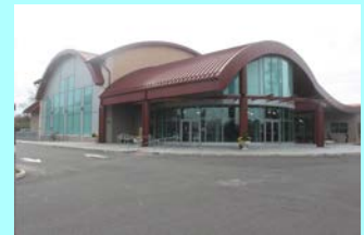
5 Pioneer Blvd., Westampton, NJ

Members' meetings are held every third Tuesday of the month at Burlington County Library Headquarters from September through May. Unless otherwise noted.